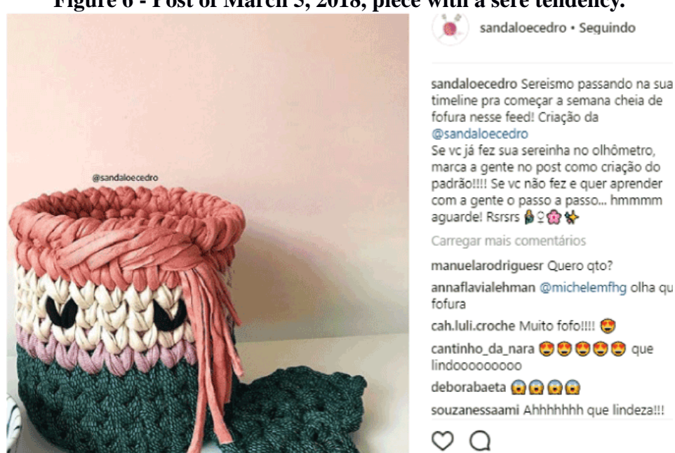
Figure 6 - Post of March 5, 2018, piece with a sere tendency.

The publication of March 5, figure 6, again brings artisans betting on market trends by disclosing a mermaid-shaped basket. Keeping an innovative spirit, anticipating exclusive techniques, the post reaches asignificant impact. In all, the post received 3,085 thousand likes and 143 comments. In the Marketing 4.0 environment, "Brands with strong intellectuality are innovative and capable of launching products and services that had not yet been imagined by other brands or by consumers" (KOTLER, 2017, p. 140), they end up achieving differentiation between their competitors and a space in the mind of the consumer. In this same disclosure, aiming at an emotional bond with its followers, the company evokes the feeling of pride of its followers and induces them to mark Sândalo and Cedro in the photos of their productions. Finally, to generate an expectation in your followers, it implies that soon a course on the technique used will be launched.