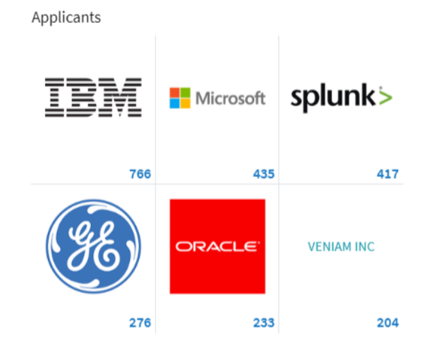
Figure 03 - Claimants

In Figure 03, it can be seen that technology companies have been searching for methods of diagnosis and measurement of their administrative processes. This allows companies to maintain continuous improvement in their organizational processes (application of governance), seeking leadership in the market.