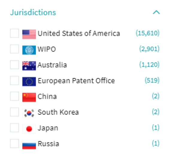
Figure 2 - Jurisdiction

In Figure 03, it can be seen that technology companies have been searching for methods of diagnosis and measurement of their administrative processes. This allows companies to maintain continuous improvement in their organizational processes (application of governance), seeking leadership in the market.